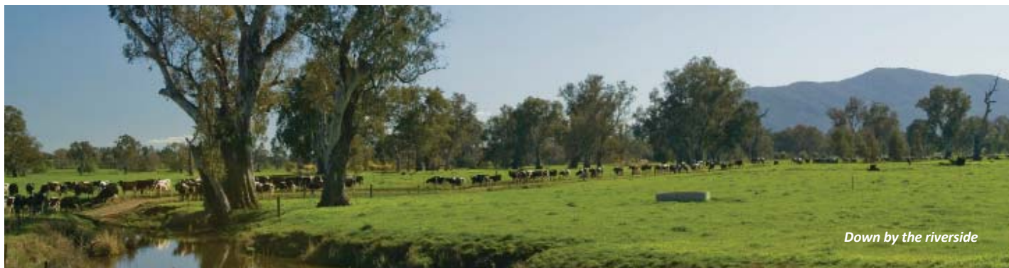
Down by the riverside

Twice a day the girls head past the ice creamery on their way uphill to the dairy, to produce the rich creamy milk that is the foundation of Gundowring Finest Ice Cream. The current word is they are exceptionally content, because their pasture is lush than it has been for years. In fact, it has rained 177mm since 1 January conjuring thick green nutritious grass so high it tickles the girls' bellies. The rains have also noticeably boosted the native bird life in the property's billabongs and given the various revegetation and Landcare projects a much needed growth spurt.